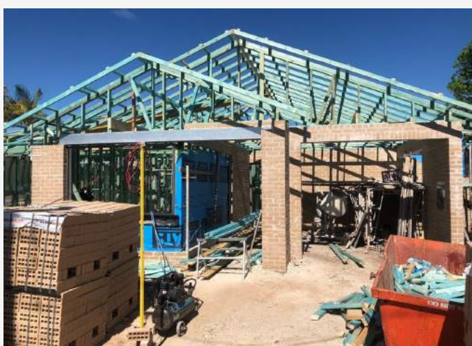
New house in Ryde