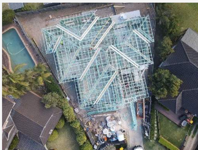
New house in Ryde