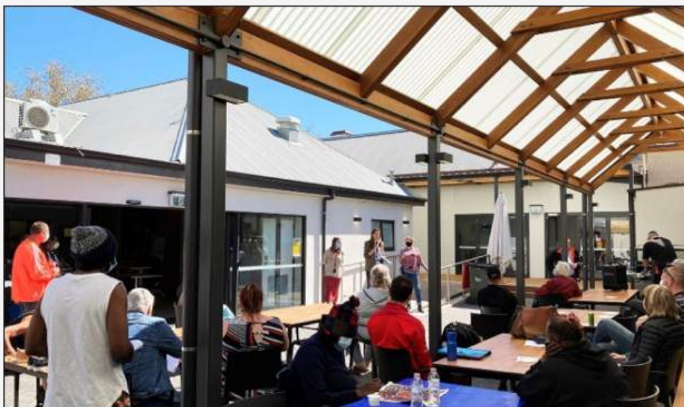
Our monthly Town Hall meetings create an important sense of community for people at risk of or experiencing homelessness in South Australia.